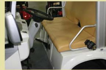
Automatic drive system (stepless speed change)