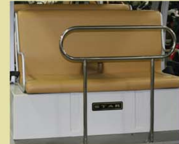
11 Passenger Bus ADS