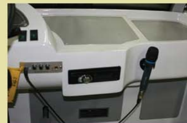
CD player and radio with 2 speakers